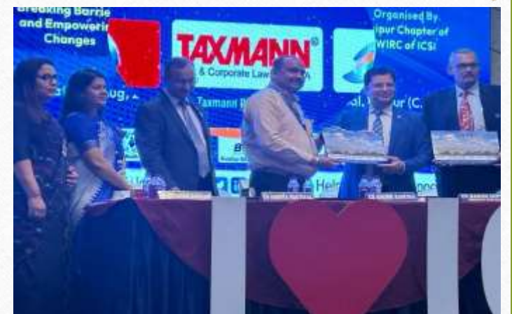
MOU-Panel discussion with ICAI