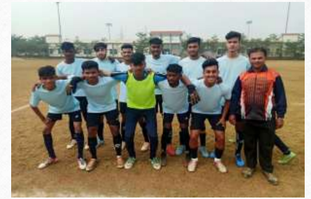
Students won the Football Tournament